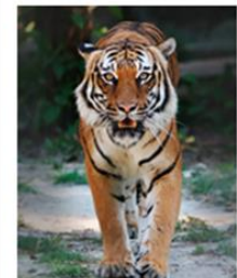
A male tiger

Tigers live on their own. They like to hunt and are the only big cat who likes to swim.